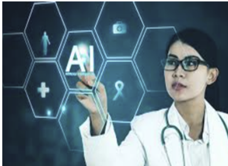
AI in healthcare

A team from the University of Toronto presented an ML model capable of predicting the onset of chronic diseases—like type 2 diabetes or heart failure—up to two years in advance, using longitudinal patient data and federated learning to preserve privacy. This approach enhances early diagnosis while ensuring data security across healthcare institutions.